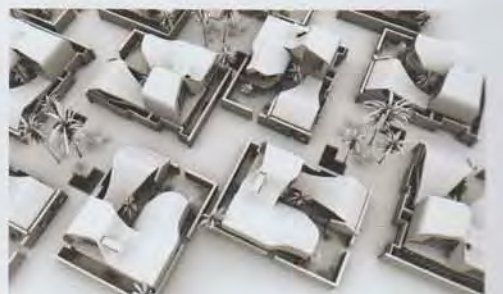
N°1 Nine Quarter City , Faculty of Architecture, The University of Sydney.