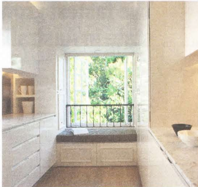
Casement windows and a window seat replace the external door. The breakfast area doubles as a study.

The exquisite blackbutt timber from Bowens used for the stair treads and floor comes in planks about 25 centimetres wide and about 3 centimetres thick. A light lime wash softens the colour. Detailing on the stair was kept simple to show off the timber.