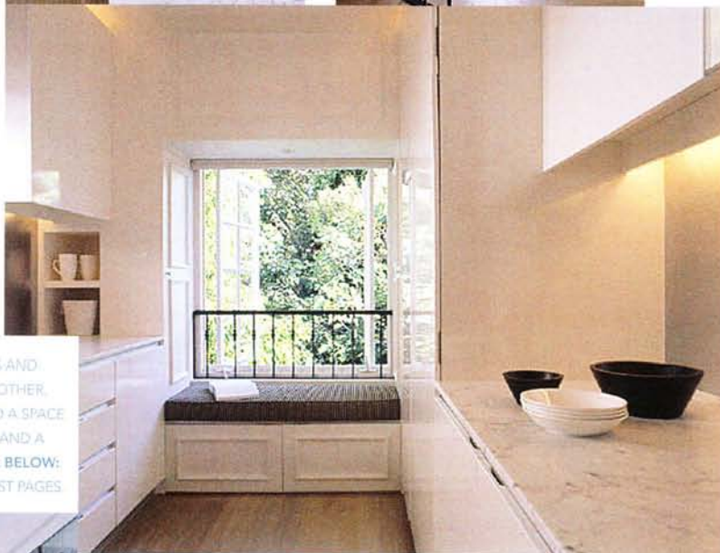
ABOVE & TOP RIGHT: ARCHITECT MATT GIBSON'S LIMITED USE OF MATERIALS AND COLOUR THROUGHOUT THIS TOORAK HOME HAS SPACES BLEED INTO EACH OTHER, CREATING A LOFTY FEEL. TOP, FAR RIGHT: A STAIRCASE PROVIDES ACCESS TO A SPACE PREVIOUSLY UNDERUSED. RIGHT: LOW-HUNG CUPBOARDS THAT REACH HIGH AND A WINDOW SEAT PROVIDE AMPLE STORAGE IN AN OTHERWISE NARROW SPACE. BELOW: VISUAL TRICKERY WITH MIRRORS CREATES THE ILLUSION OF SPACE. DETAILS, LAST PAGES.